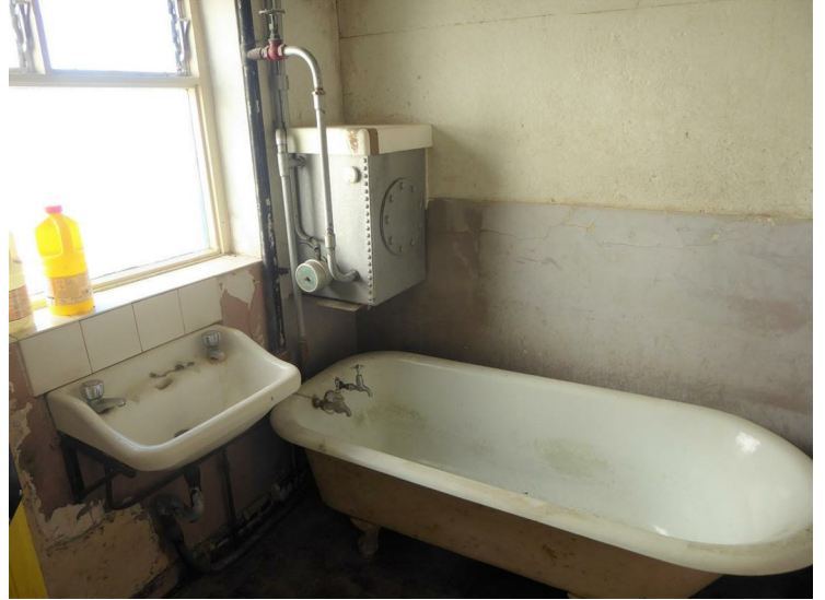
Wash hand basin, high level w.c, freestanding bath.