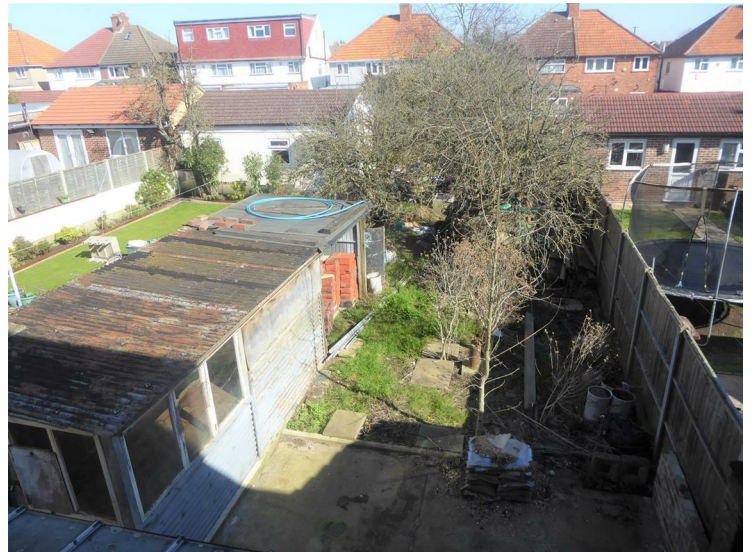
Concrete area, rest laid to lawn, storage shed.