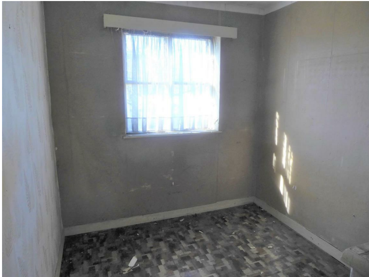
Front aspect window, access to loft space.