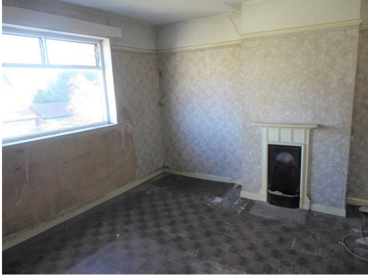
Rear aspect window, feature fireplace.